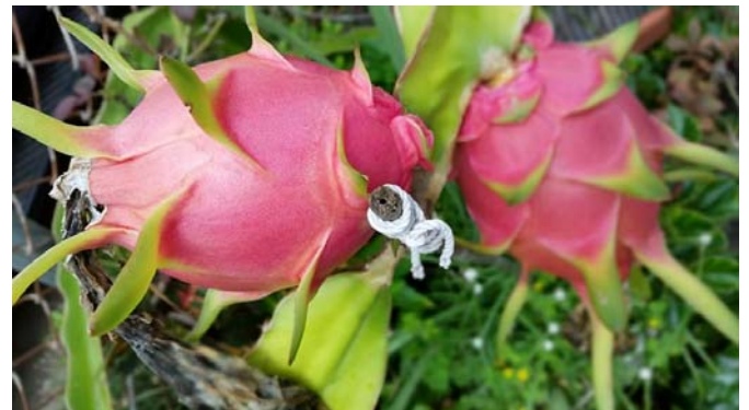
This is the very first Dragon-fruit that has grown in the church yard. Kami-Sama's blessings come in all shapes and sizes.

Editor's thoughts: People these days are especially concerned about one's intellectual abilities—not realizing that Kami-Sama is the one who chooses the individual to teach others lessons in life. In the religious world, we seek speakers who have a higher education, but the very founders who initiated the faith were uneducated and humble. Kami-Sama doesn't care about one's socioeconomic state. Kami is only concerned of the sincerity of a person's heart. Look forward to being of service to Kami-Sama.